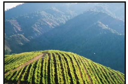
Hidden Ridge Vineyard 55% Slope

For more information about Hidden Ridge Cabernet Sauvignon visit www.vintagepoint.com/hiddenridgetrade